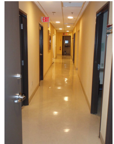
Hallway to treatment rooms