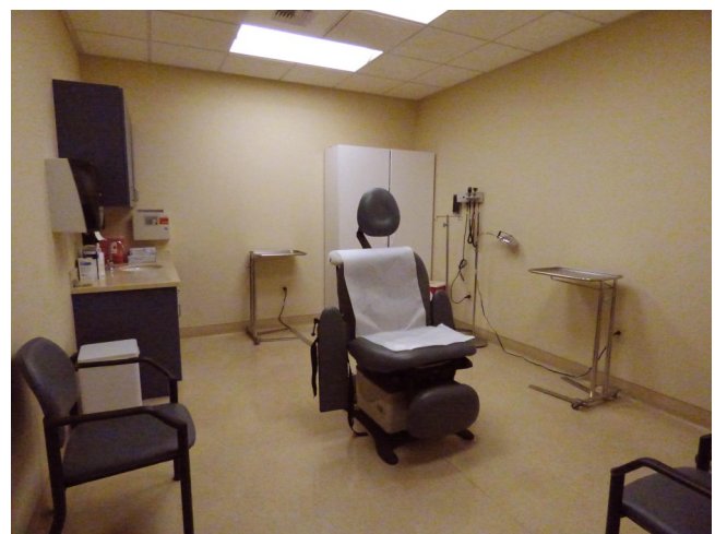
Two of the treatment rooms. All are wet.