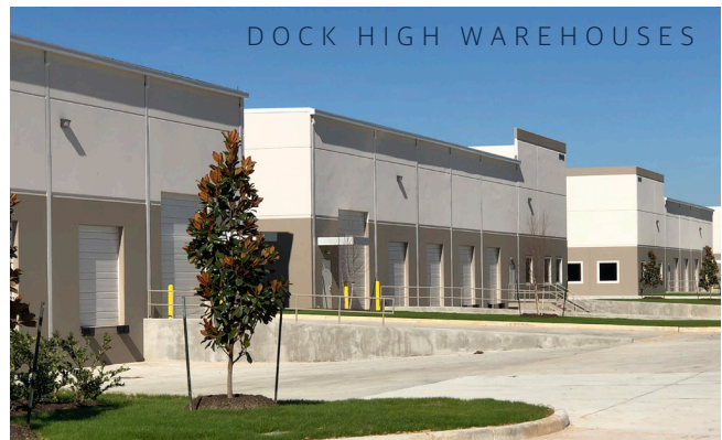
SEE PAGE 3 FOR MORE DETAILS