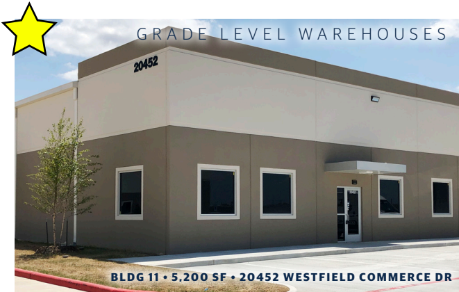
SEE PAGE 4 FOR MORE DETAILS