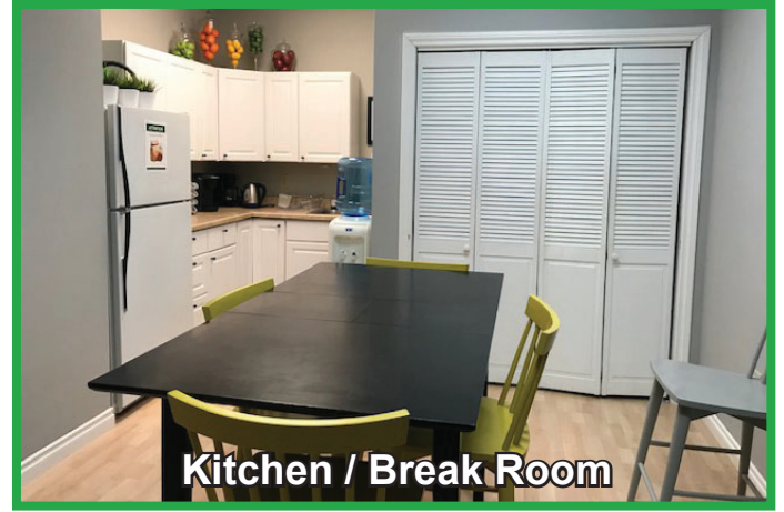
Kitchen / Break Room