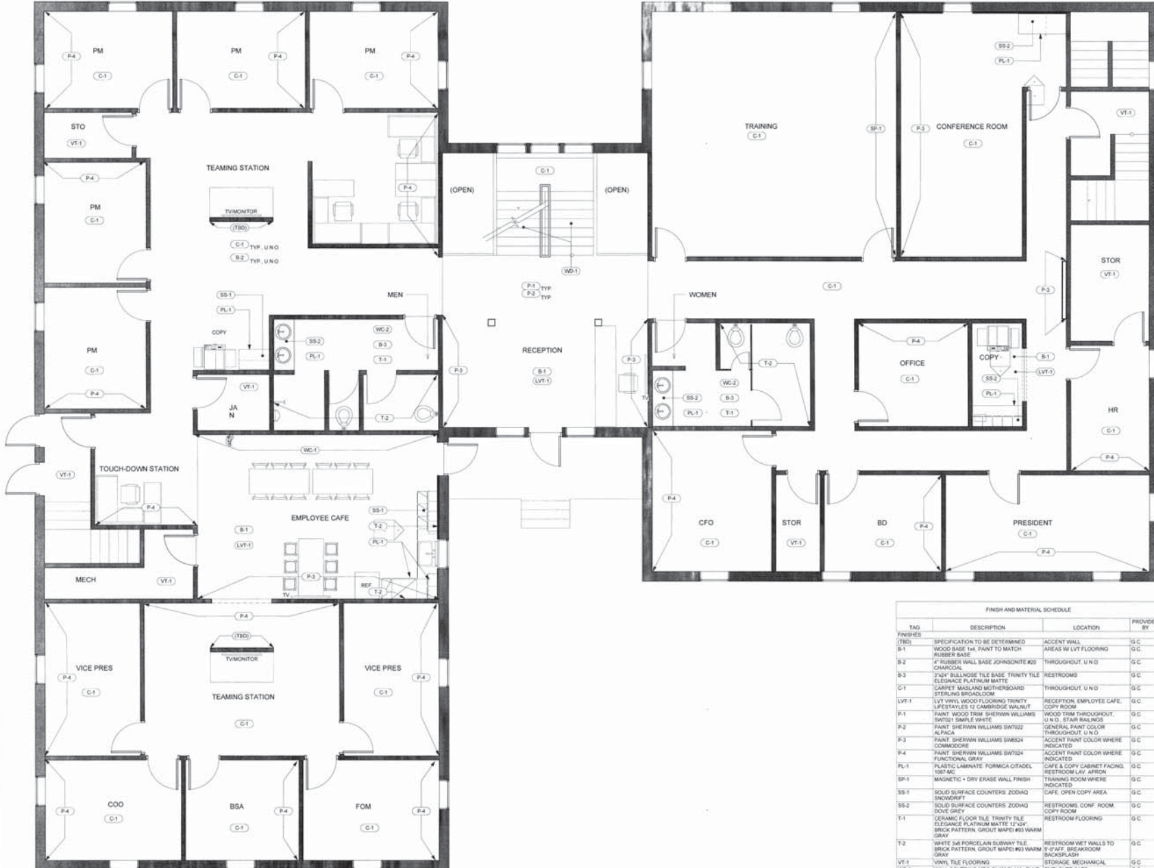
1 LEVEL 02 FINISH PLAN 1/4" = 1'-0"