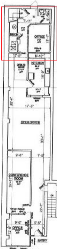
FIRST FLOOR 1,833 SQ FT SCALE: 1/8"=1'-0"