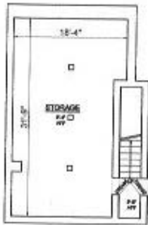
BASEMENT 500 SQ FT SCALE: 1/8"=1'-0"