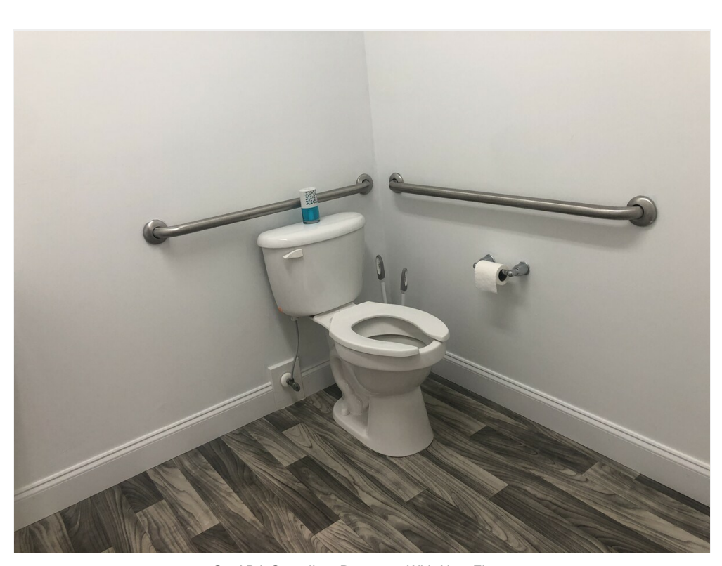
Q - ADA Compliant Restroom With New Floors