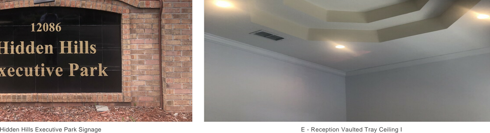
D - Hidden Hills Executive Park Signage