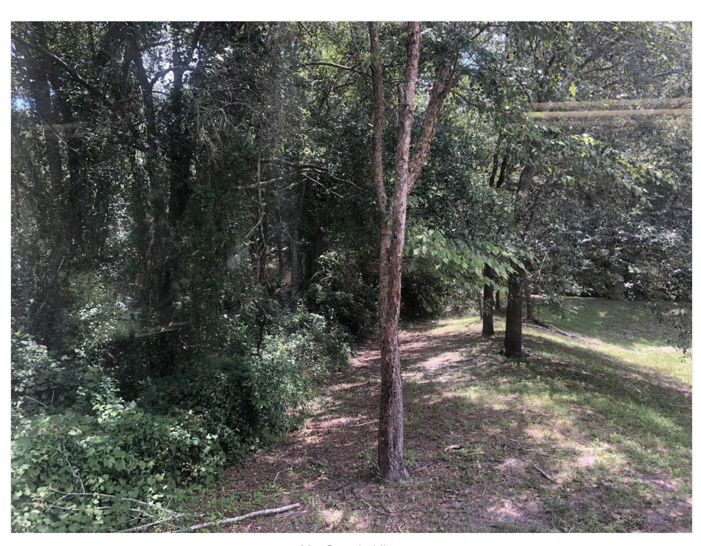
L - Scenic View From Corner Office