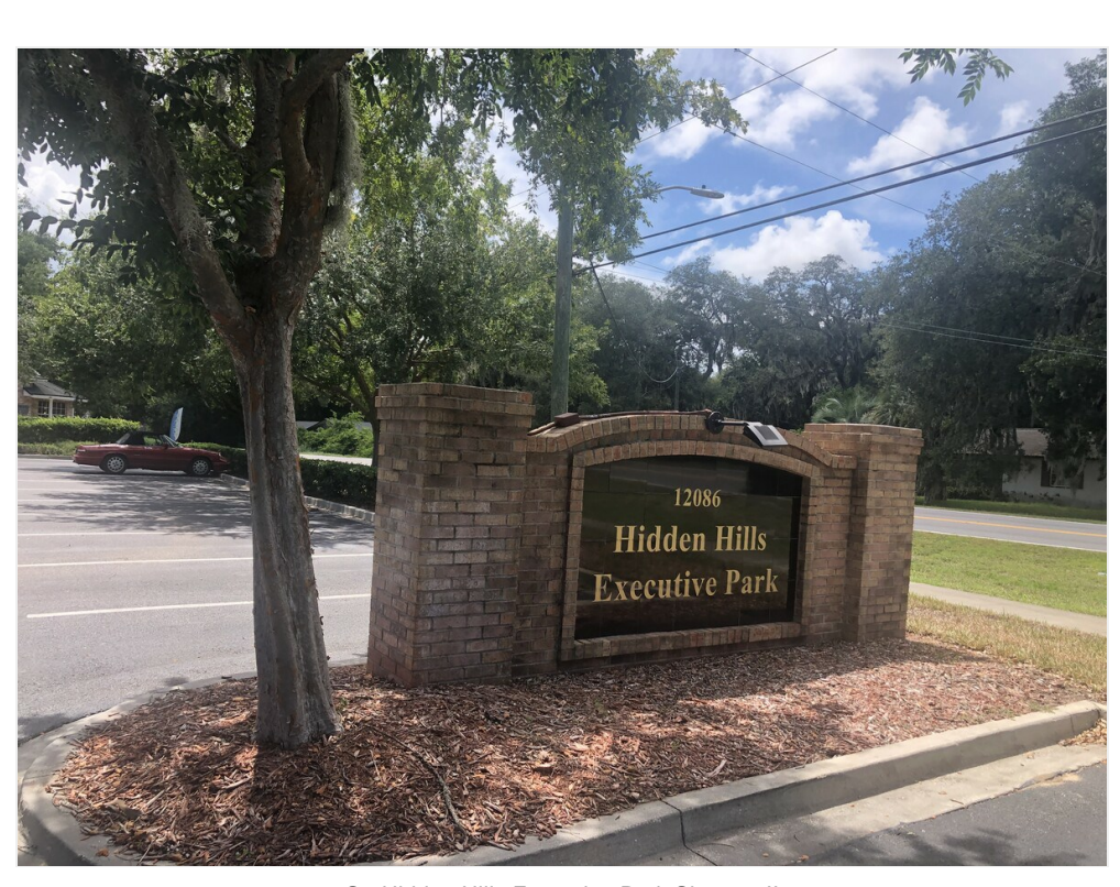
S - Hidden Hills Executive Park Signage II