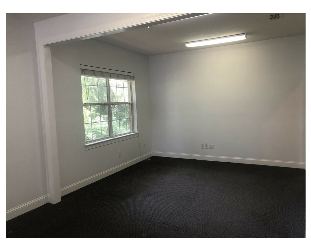
G - Large Conference Room II