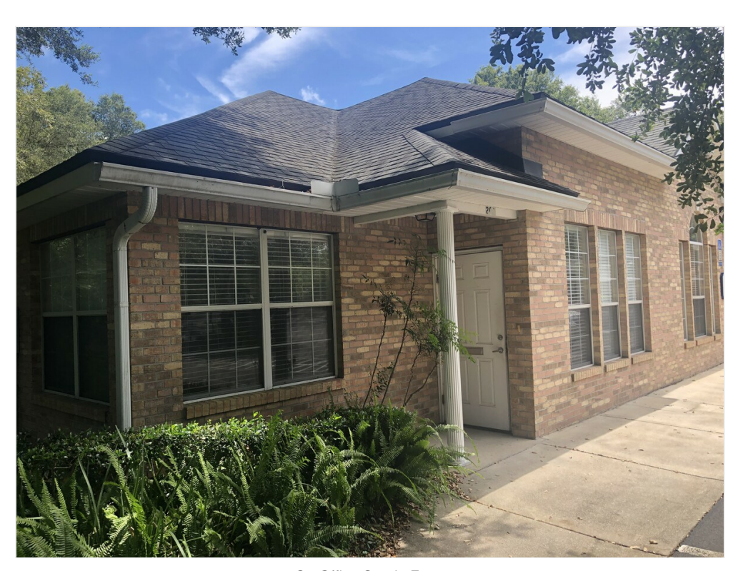
B - Front Exterior A C - Office Condo Entry