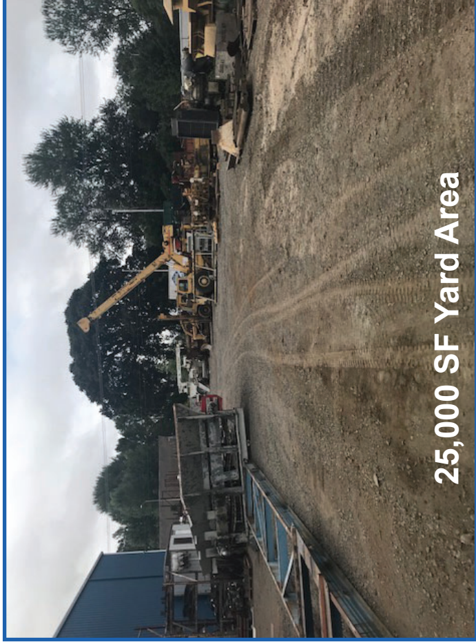
25,000 SF Yard Area