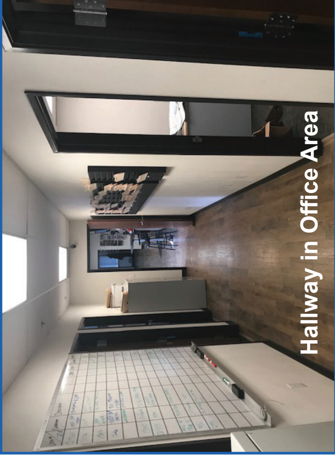
Hallway in Office Area