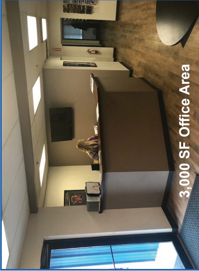
3,000 SF Office Area