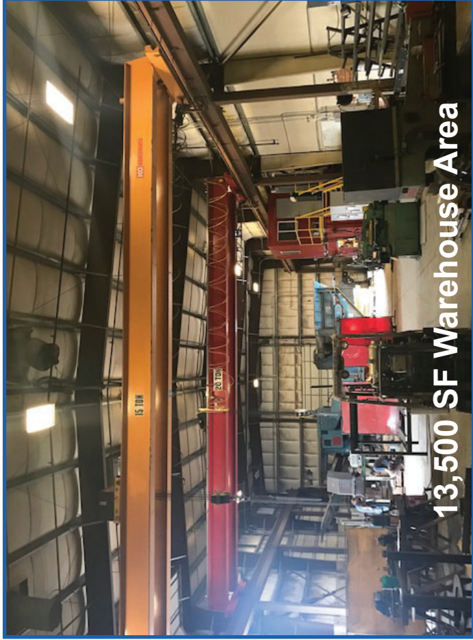
13,500 SF Warehouse Area