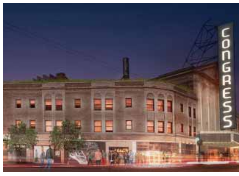
Congress Theater – $55M Renovation