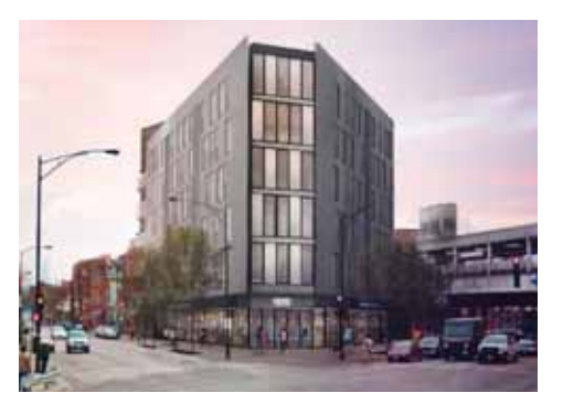
The Western – 44 Units