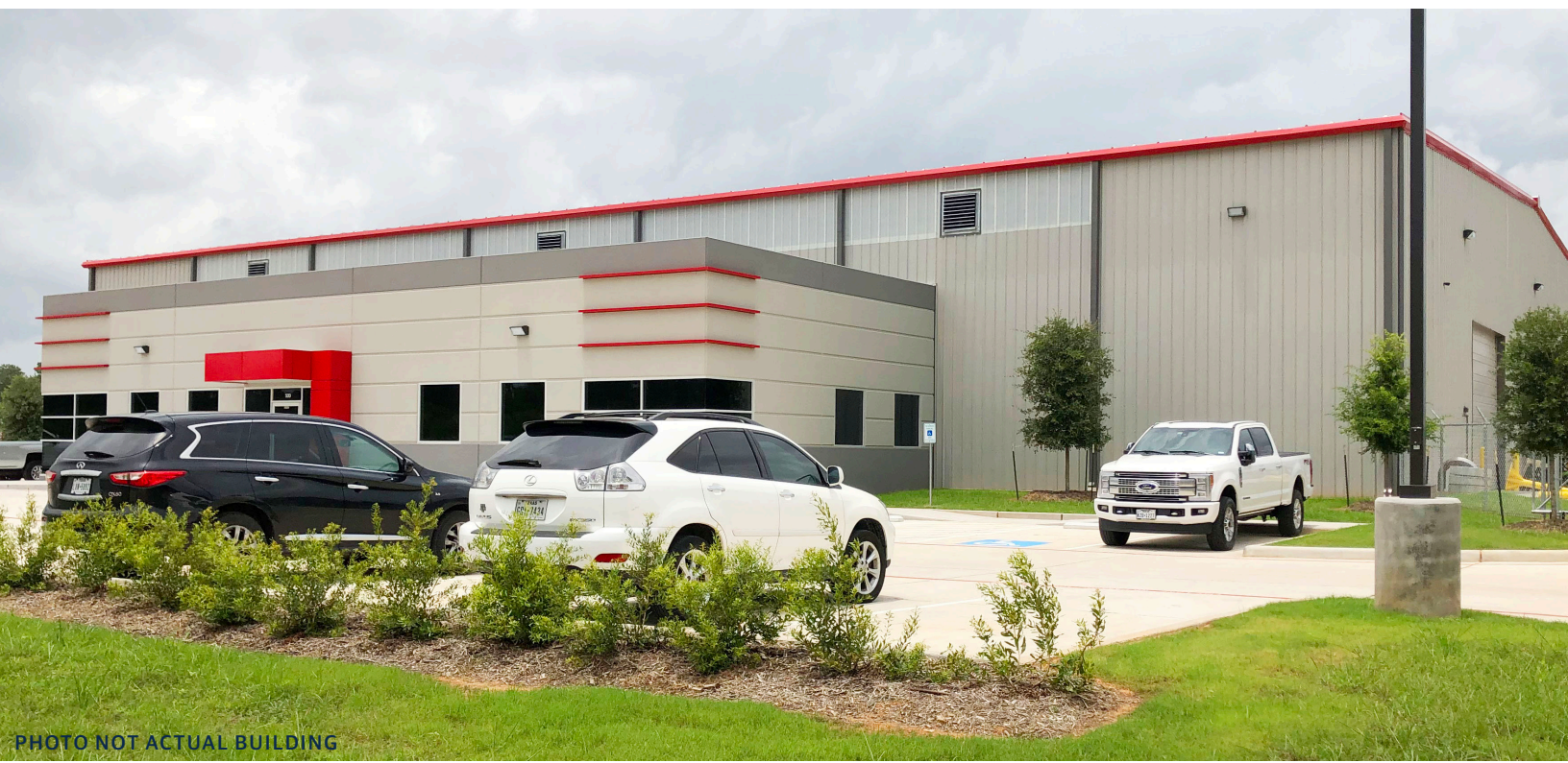
PHOTO NOT ACTUAL BUILDING