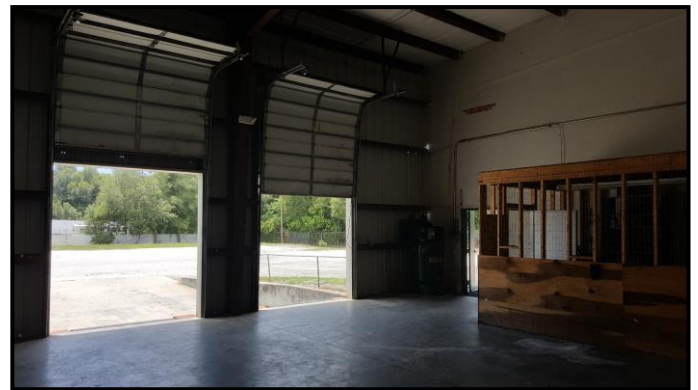
Warehouse Area and Truck Well