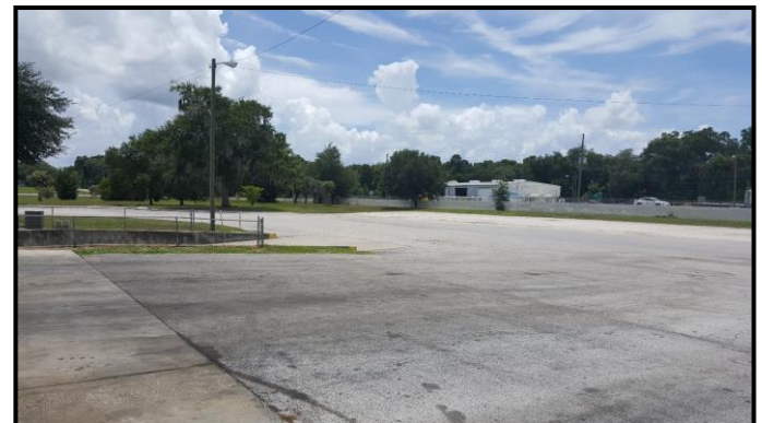
Trailer Parking Area

This information is from sources deemed to be reliable. We are not responsible for misstatements of facts, errors or omissions, prior sale, change of price, and/or terms or withdrawal from the market without notice. Buyer should verify all information with its' own representatives as well as state and local agencies. Brokers please note that a variable rate commission may exist on this offering that might result in a lower commission cost to the Seller if a Buyer's broker is not involved in the transaction. ©2016 BHH Affiliates, LLC. An independently owned and operated franchisee of BHH Affiliates, LLC. Berkshire Hathaway HomeServices and the Berkshire Hathaway HomeServices symbol are registered service marks of HomeServices of America, Inc.® Equal Housing Opportunity.