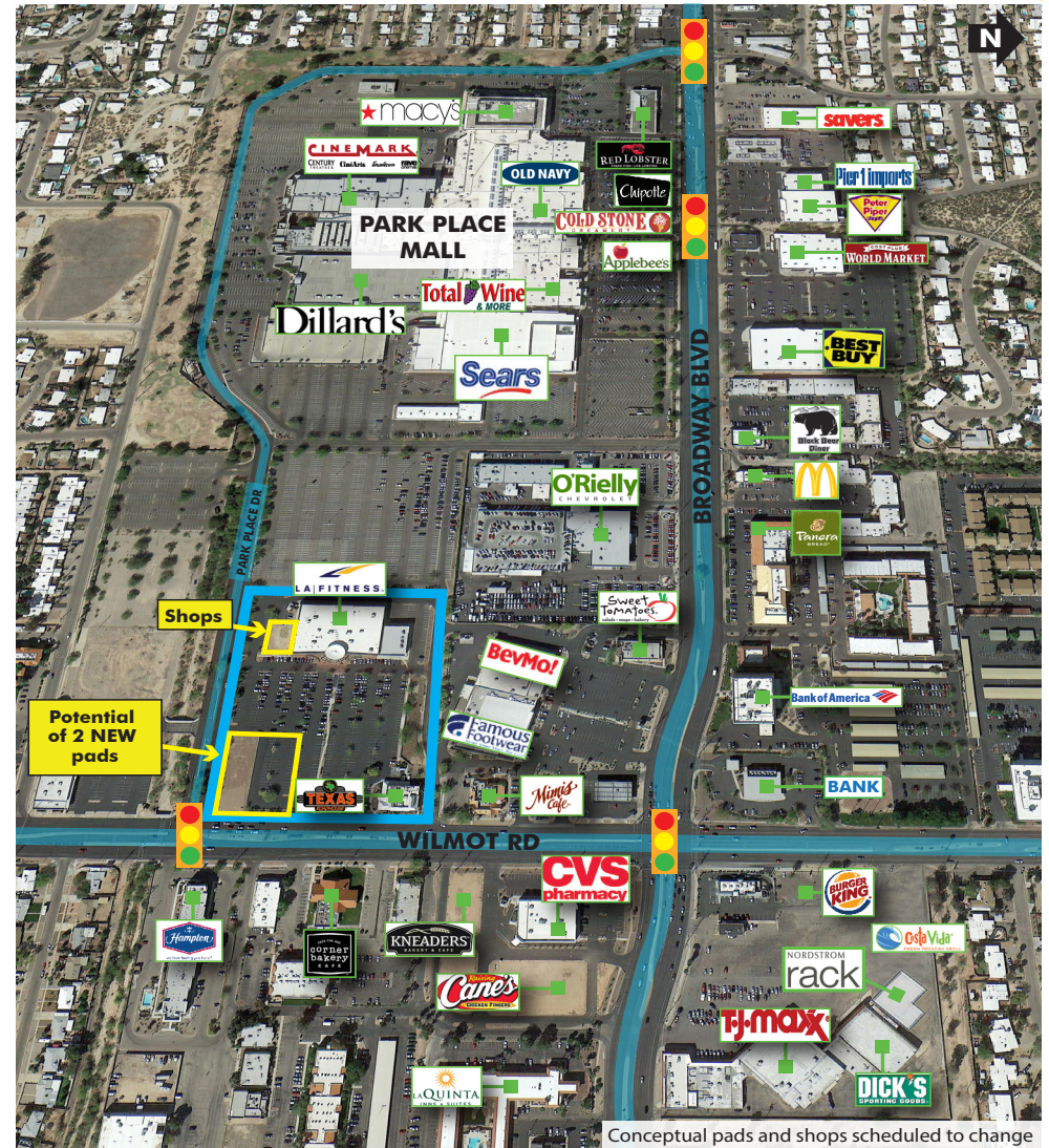
Conceptual pads and shops scheduled to change