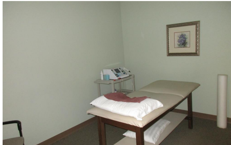
Typical Private Office/Treatment Room