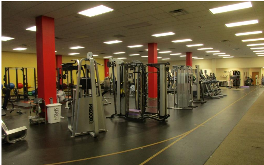
Wide Open Area