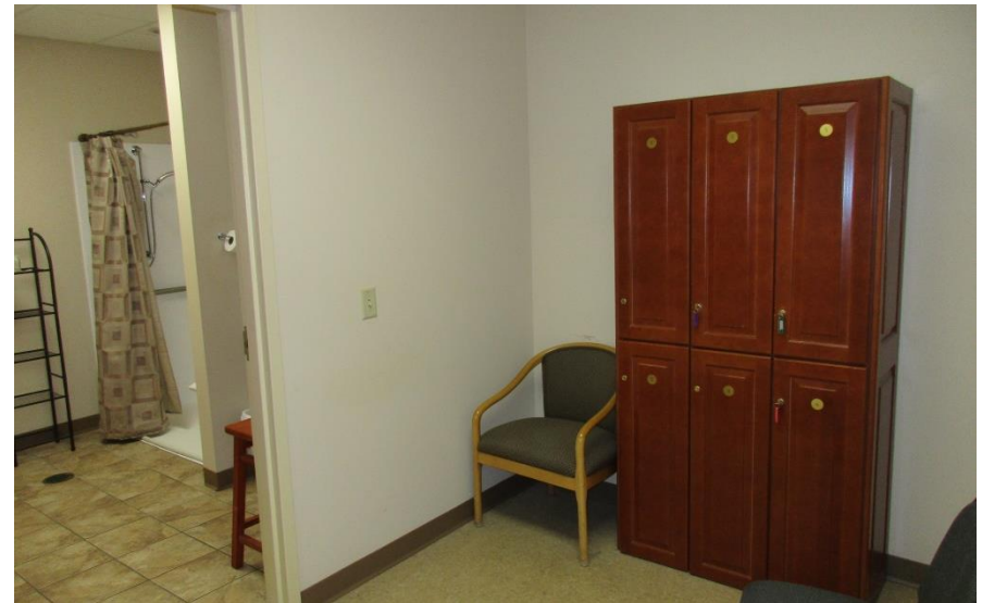
Restroom with Shower and Lockers