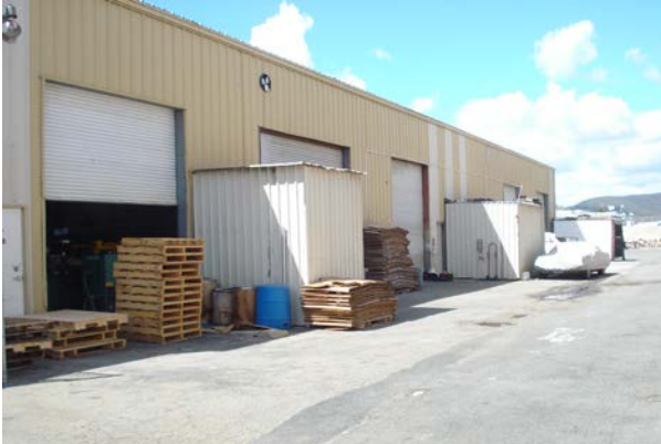
Oversized roll up doors & drive around access

255 Industrial Street, Suite A, San Marcos, CA 92078