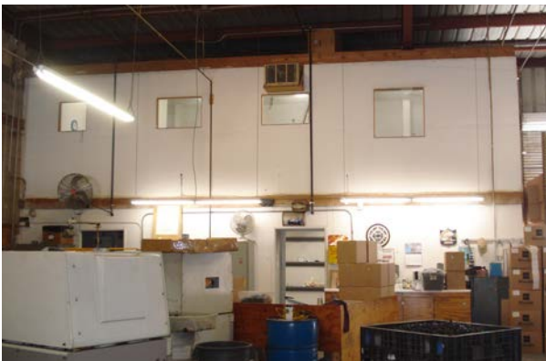
Bonus 2nd floor office with windows (not counted in SF)