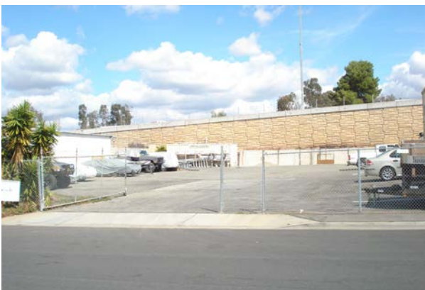
Gated, secured area behind building