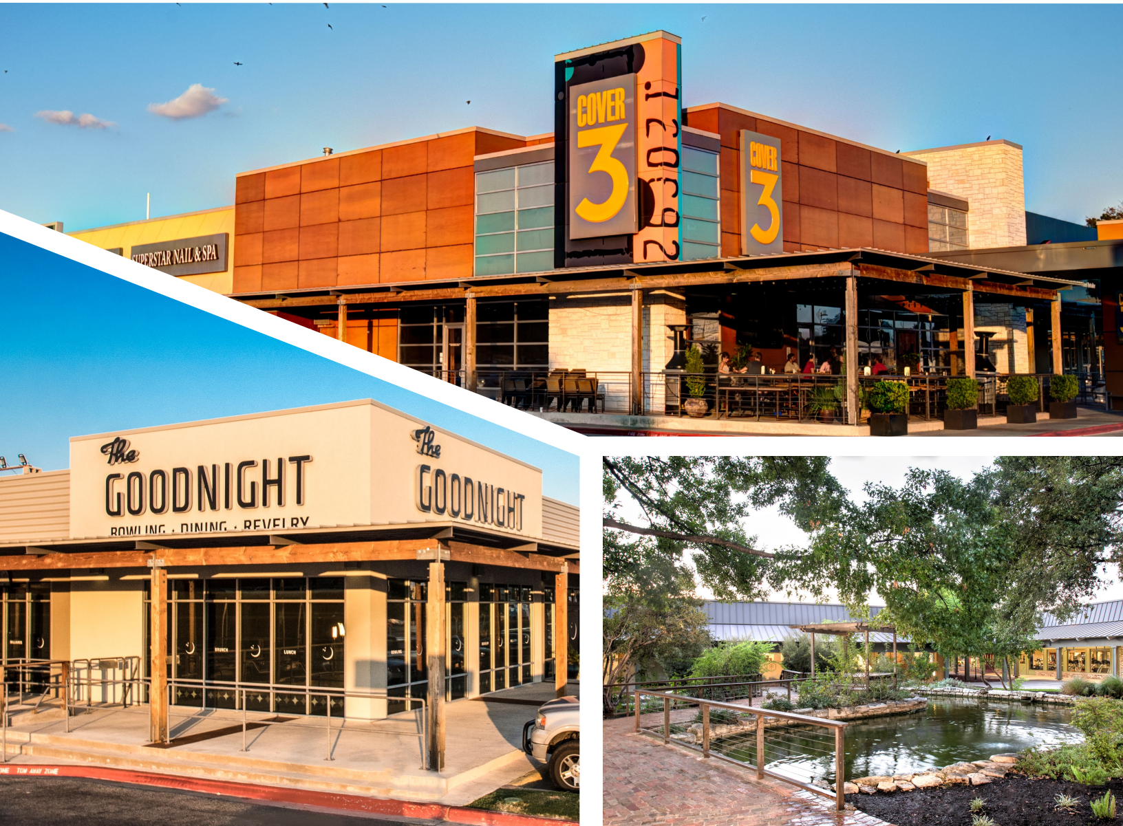
Top, left, right: Cover 3, The Goodnight, courtyard

2700 W. ANDERSON LANE • AUSTIN, TEXAS 78757