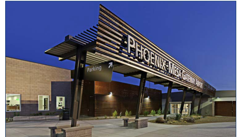
PHOENIX-MESA GATEWAY AIRPORT

Queen Creek, in the southeast corner of Maricopa County, Arizona is within 10 minutes of Phoenix-Mesa Gateway Airport and 45 minutes of Sky Harbor International Airport. This small town is an oasis in the East Valley of the Phoenix metropolitan area.