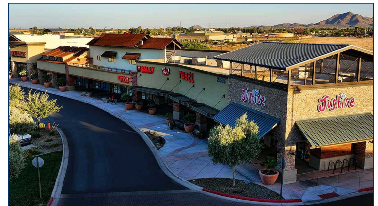
QUEEN CREEK MARKETPLACE