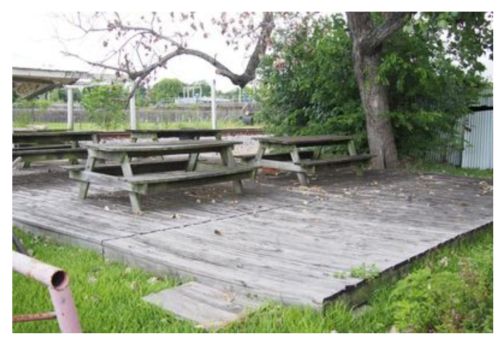
12214 Market-#4 12214 Market-#5