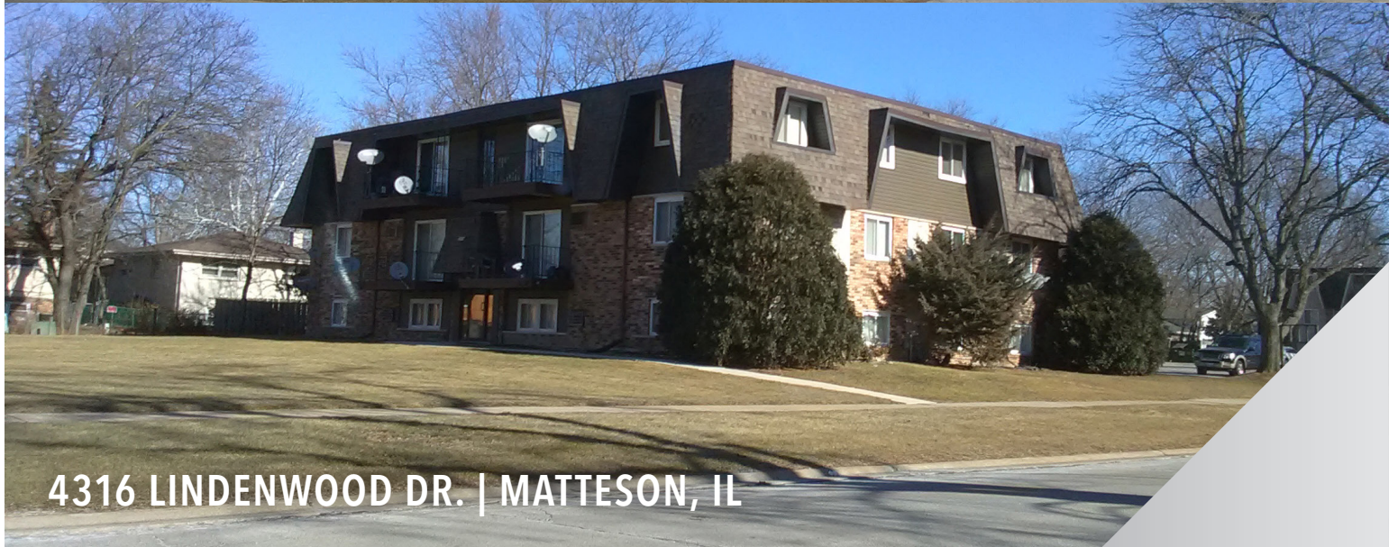
4316 LINDENWOOD DR. | MATTESON, IL