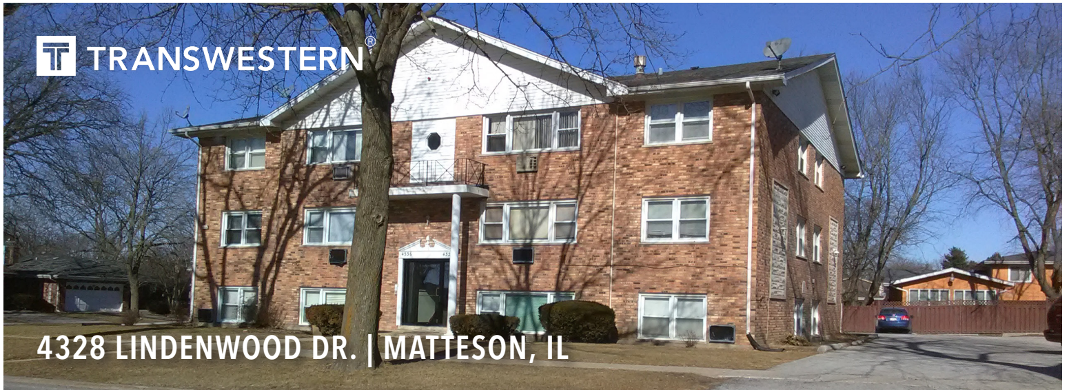
4328 LINDENWOOD DR. | MATTESON, IL