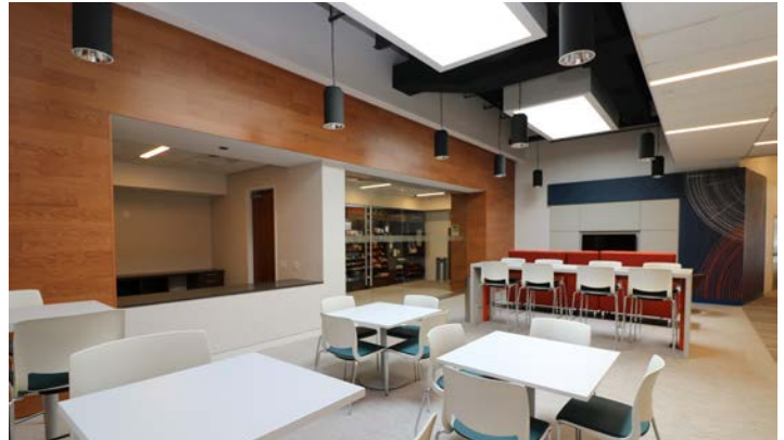
GRAB-AND-GO CAFE AREA