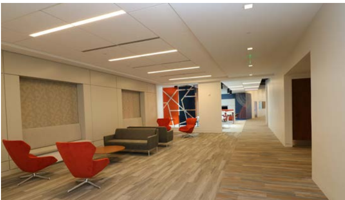
UPGRADED LOBBY AREAS