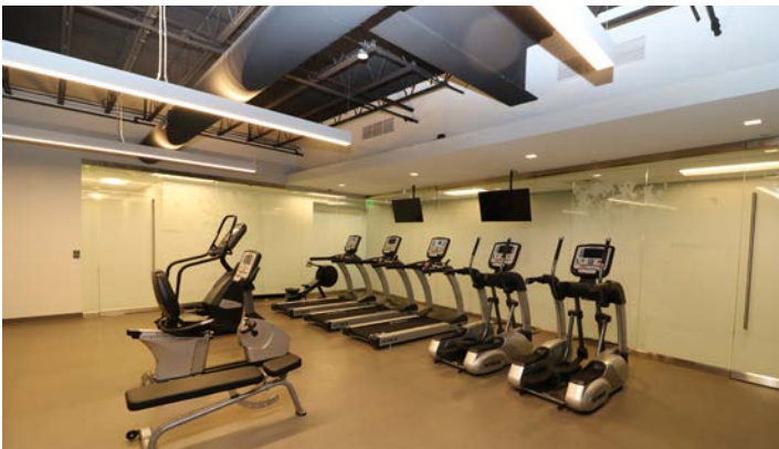
NEW FITNESS FACILITY