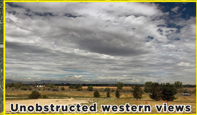
Unobstructed western views

The information contained in this brochure was compiled from reliable sources, however Crosbie Real Estate Group, LLC does not warrant nor guarantee the accuracy of the representations herein. Crosbie Real Estate Group, LLC and its broker associates, as listed, are representing the Landlord/Seller of this property. Different brokerage relationships exist.