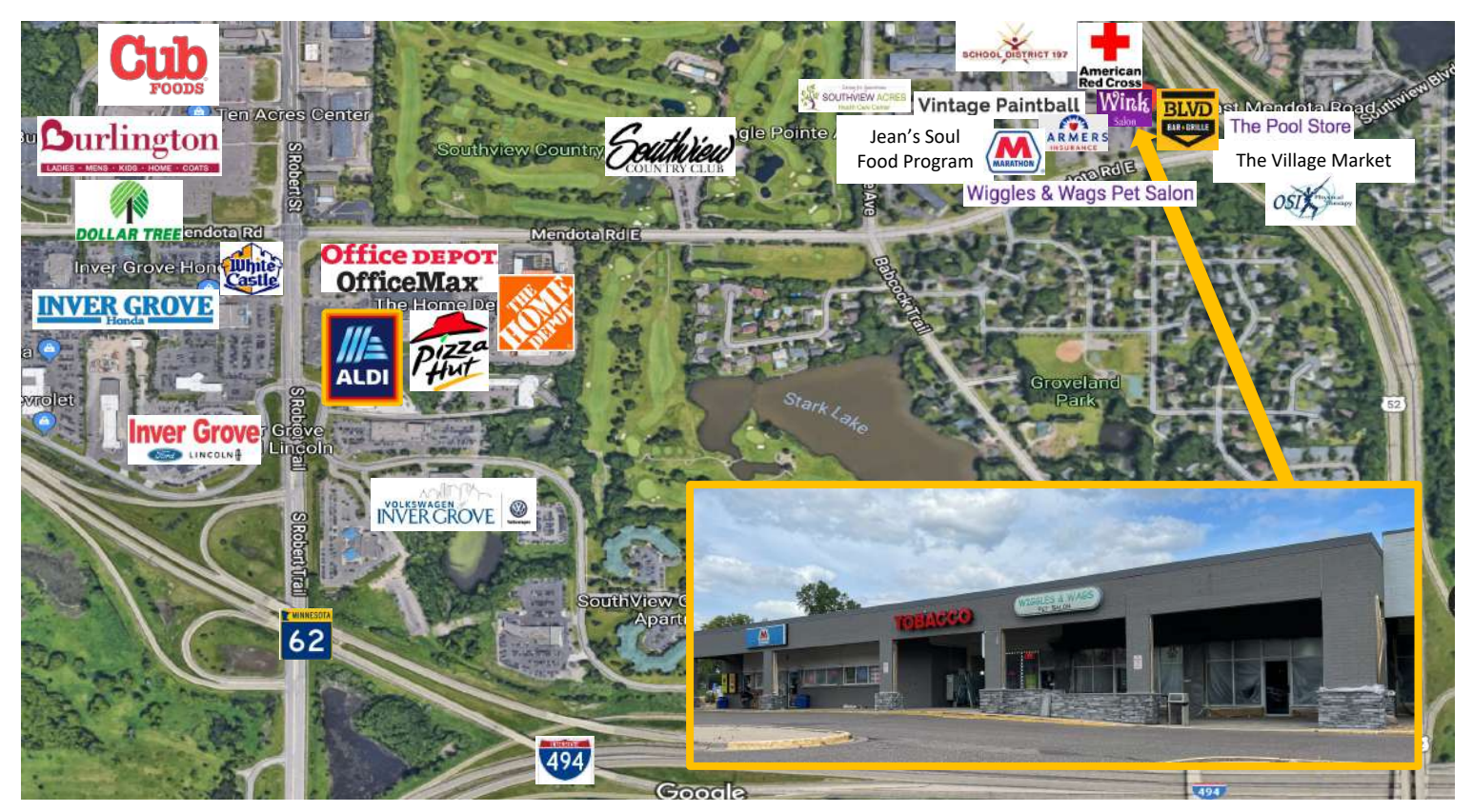
This information is accurate as of the date of printing and is subject to change without notice. All information is deemed accurate, but cannot be guaranteed.