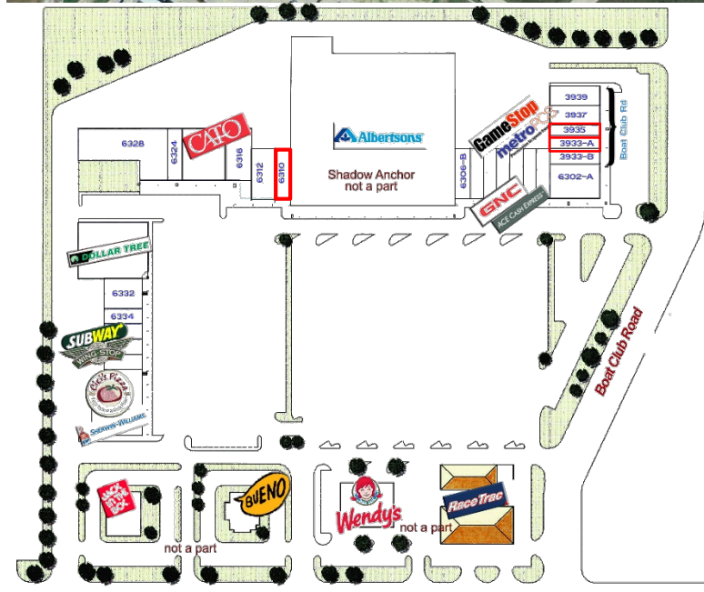
Lake Worth Blvd / Jacksboro Hwy / S.H. 199