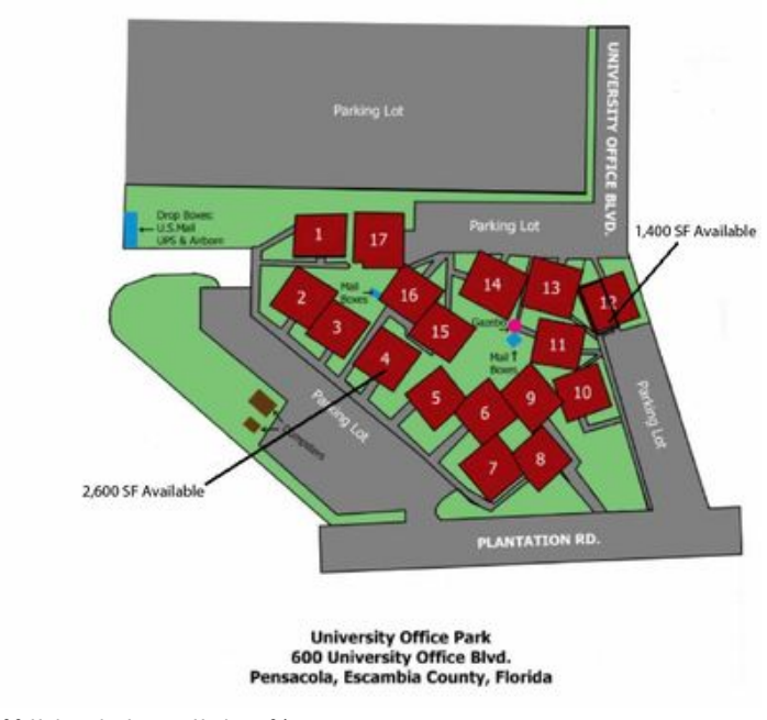
600 University Layout Update-01