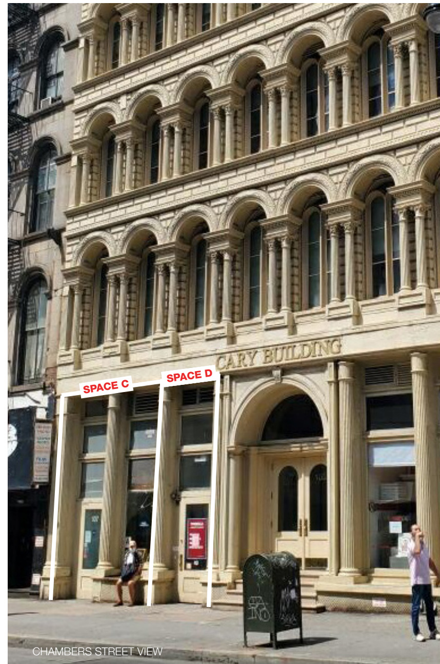
CHAMBERS STREET VIEW

Spaces can be taken individually, combined or in any combination for entrances on Church Street, Chambers Street or both.