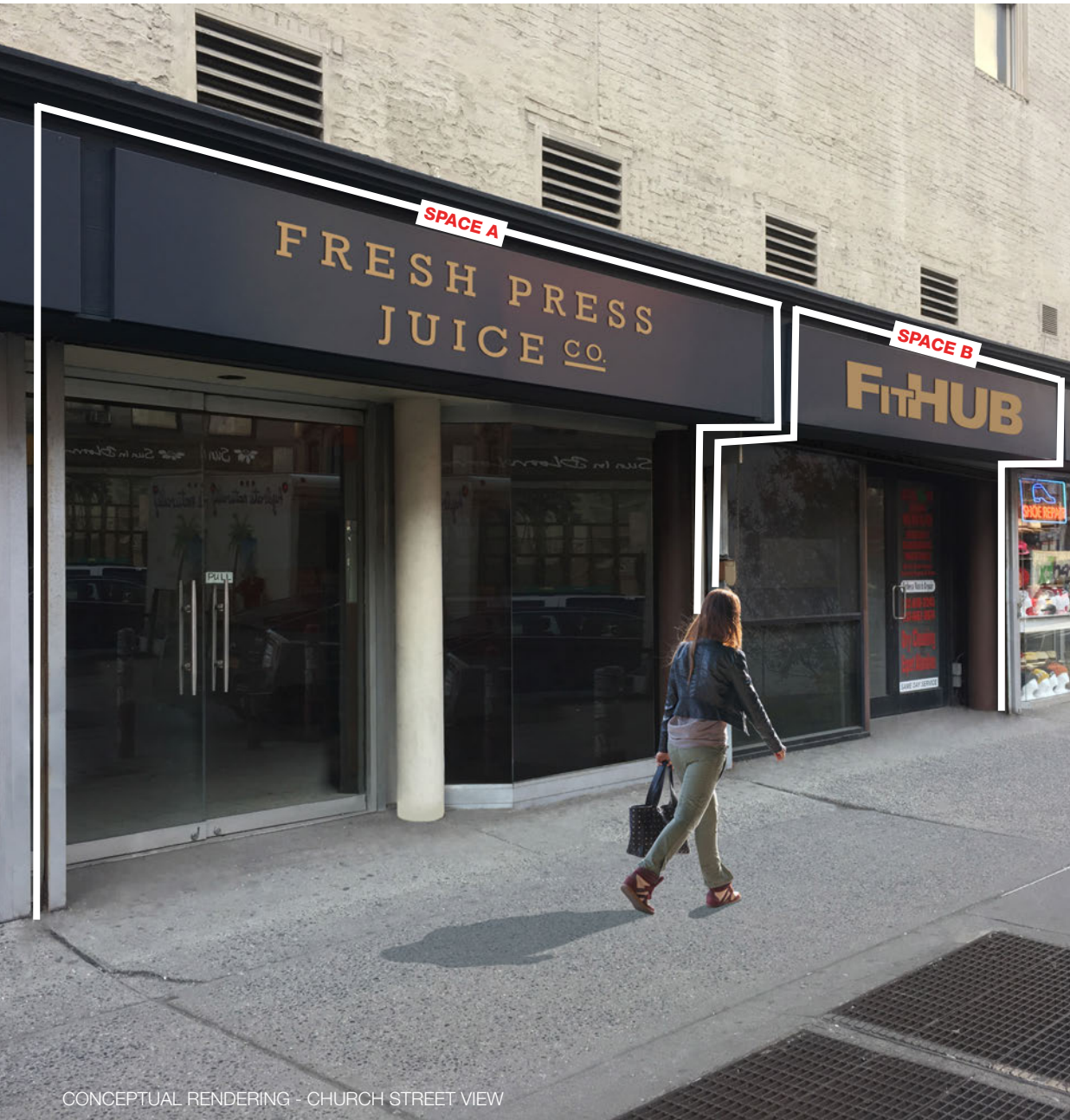
CONCEPTUAL RENDERING - CHURCH STREET VIEW