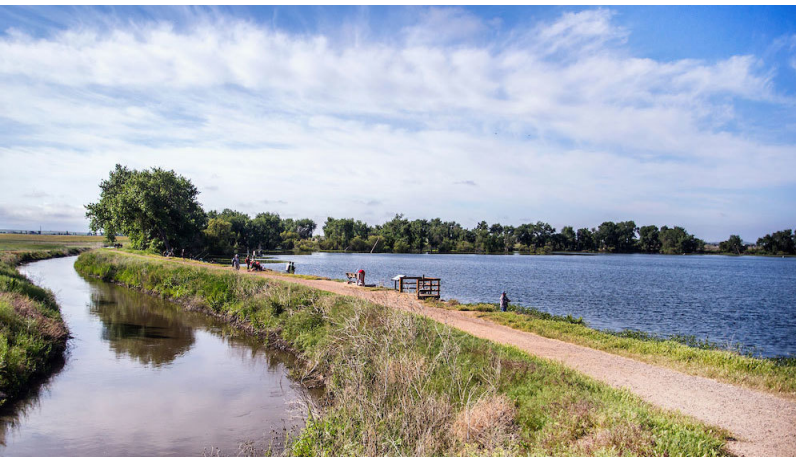
Photo provided by Colorado Parks & Wildlife - Barr Lake cpw.state.co.us

The Wild Animal Sanctuary is located within 15 minutes of Keenesburg, CO. The Wild Animal Sanctuary currently operates two sites within Colorado totaling more than 10,0000 + acres! providing a sanctuary for rescued animals so that they can live and roam freely within large natural habitats with others of their own kind. www.wildanimalsanctuary.org