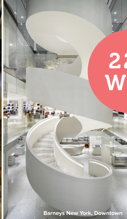
Barneys New York, Downtown