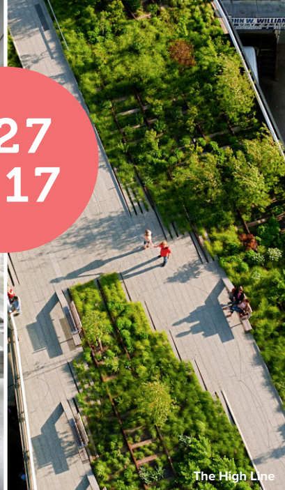
The High Line