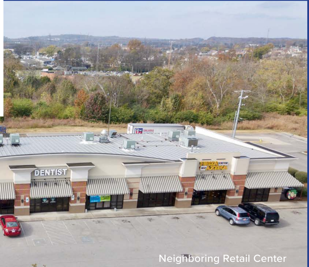
Neighboring Retail Center