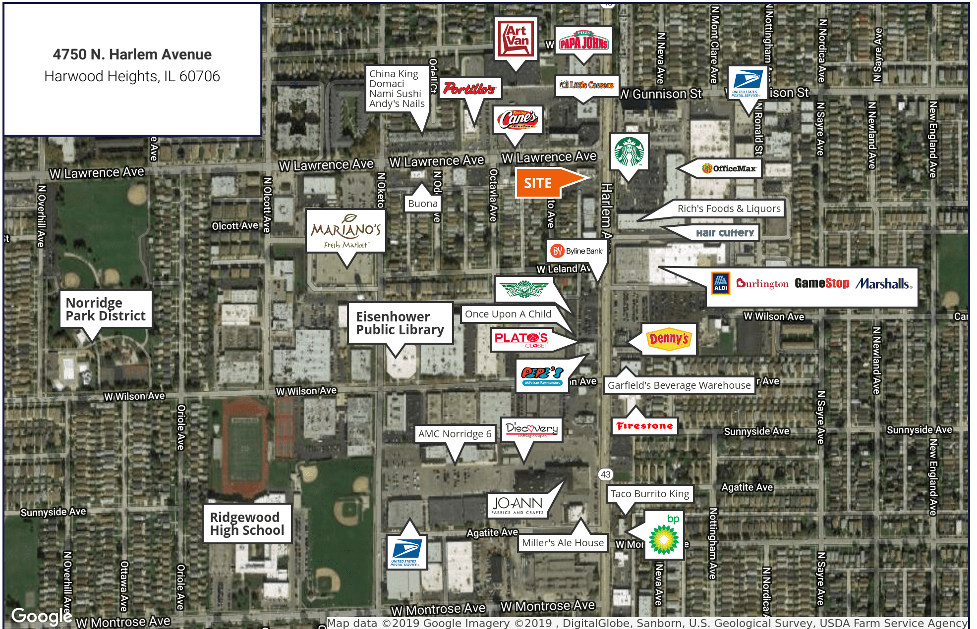
Map data ©2019 Google Imagery ©2019 , DigitalGlobe, Sanborn, U.S. Geological Survey, USDA Farm Service Agency

4750 N. Harlem Avenue Harwood Heights, IL 60706