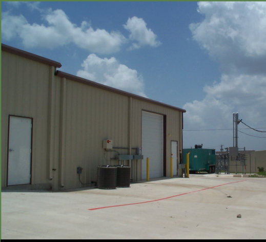
Rear roll up doors concrete pad

LEASING CONTACT GAY RUGGIANO The Kucera Companies gay.ruggiano@kuceraco.com (512) 279-9233 direct (512) 228-8555 cell