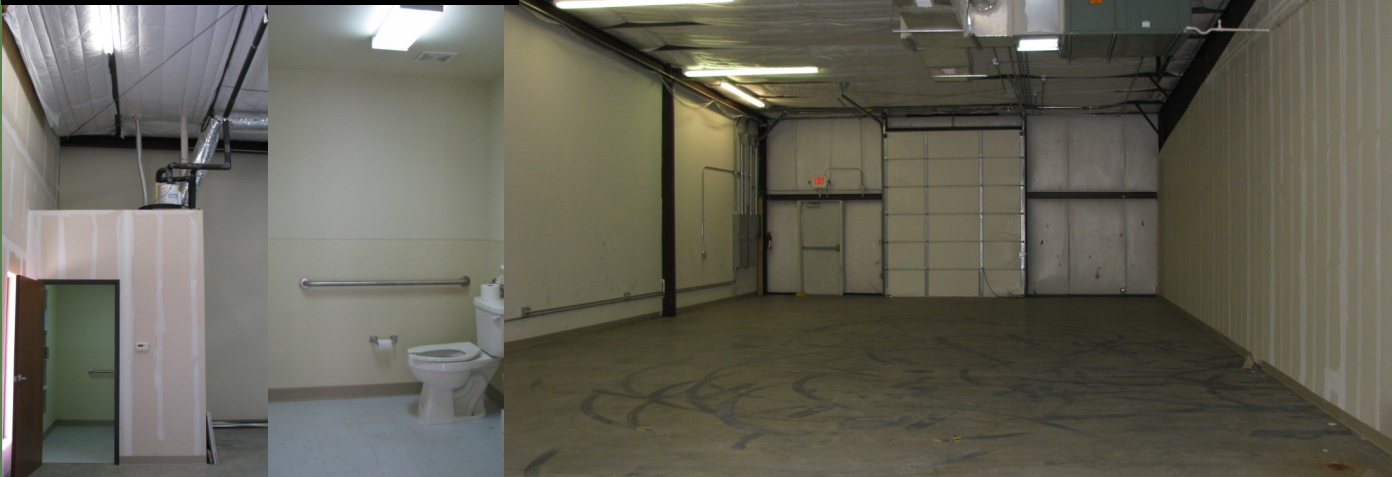
ADA Restroom and Open Warehouse with Grade Level roll-up rear doors, ATT & Electric Service.