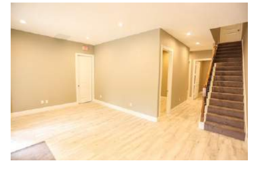
STAIRS TO MEZZANINE