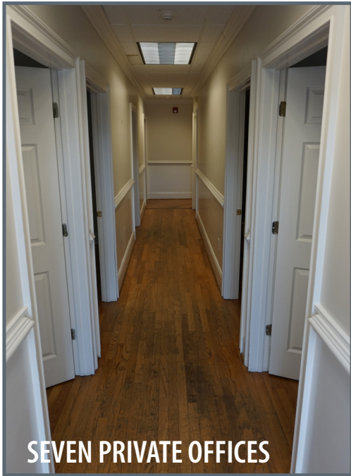
SEVEN PRIVATE OFFICES