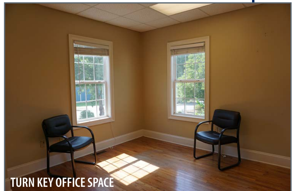
TURN KEY OFFICE SPACE