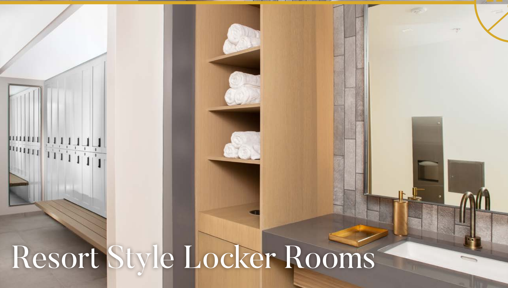
Resort Style Locker Rooms