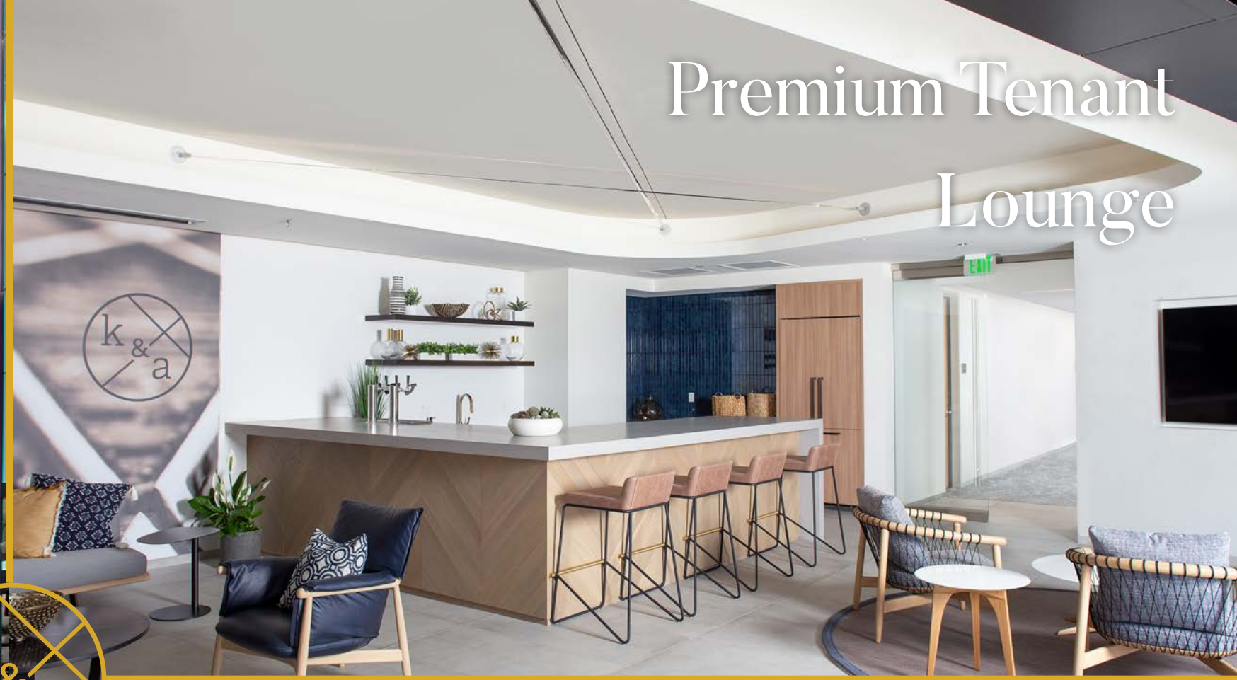
Premium Tenant Lounge