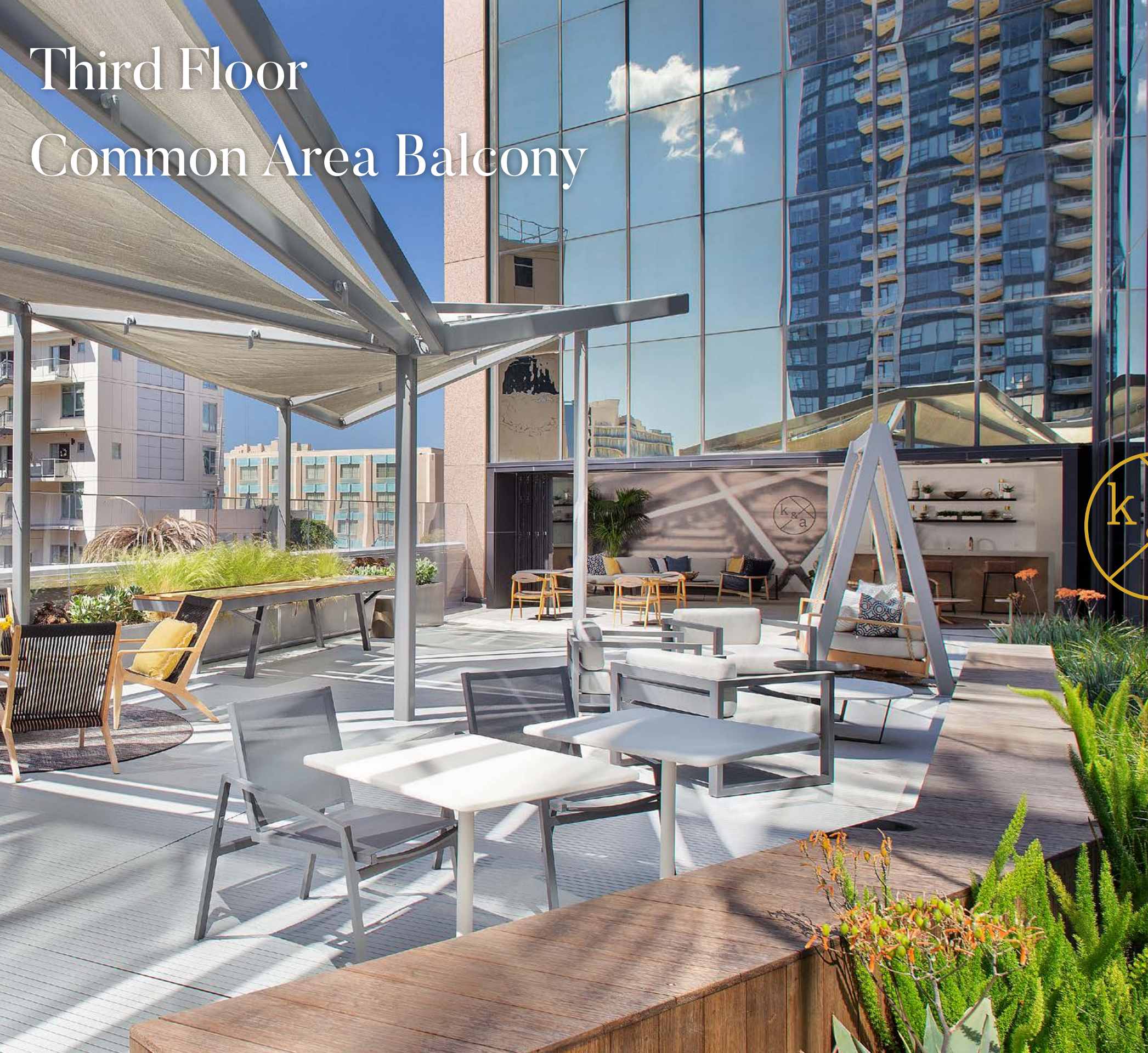
Third Floor Common Area Balcony