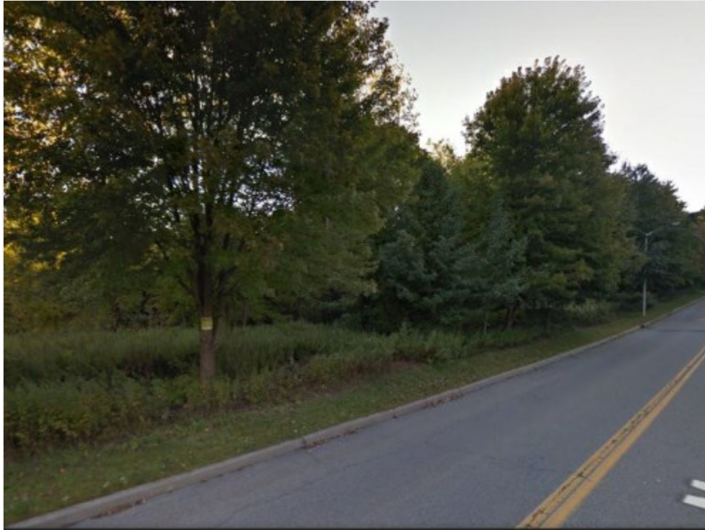
Morgan Dr Frontage