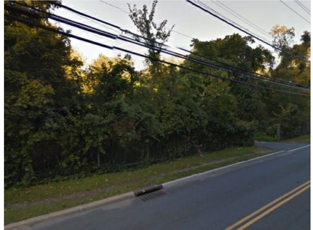
Lexington Ave Frontage