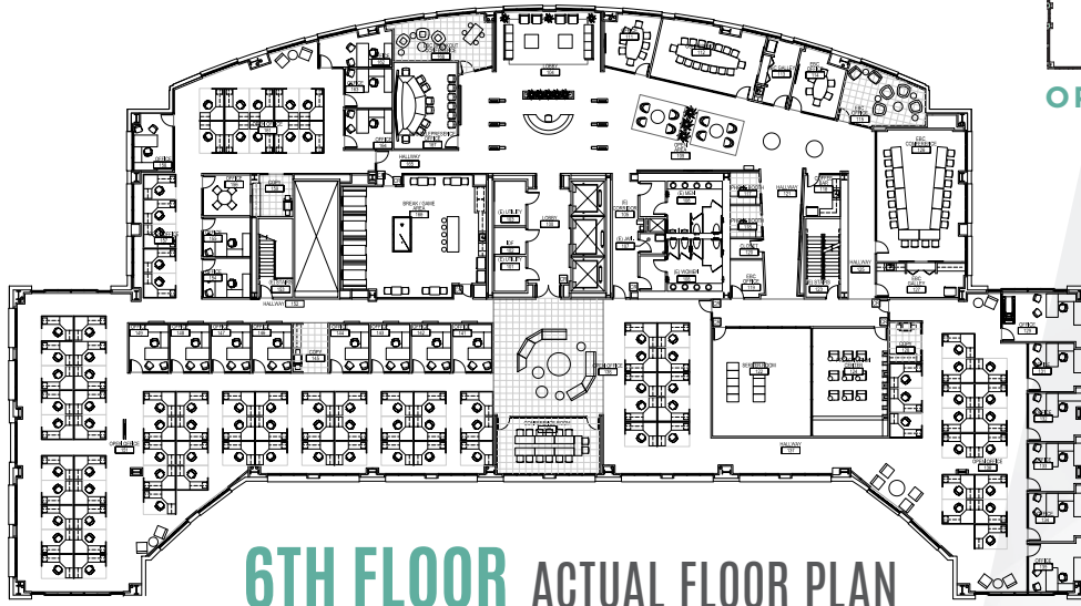
6TH FLOOR ACTUAL FLOOR PLAN