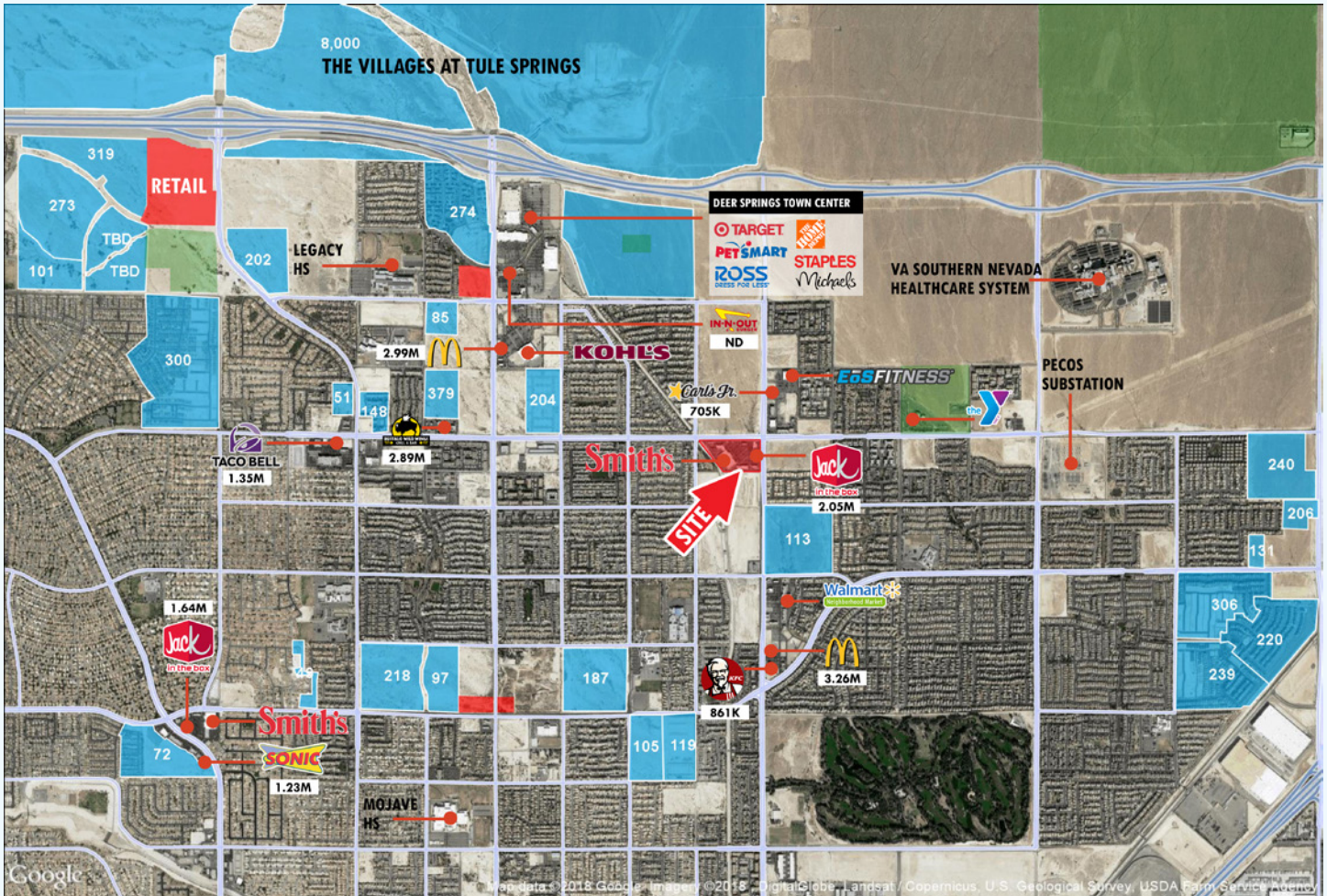
Trade Area Map