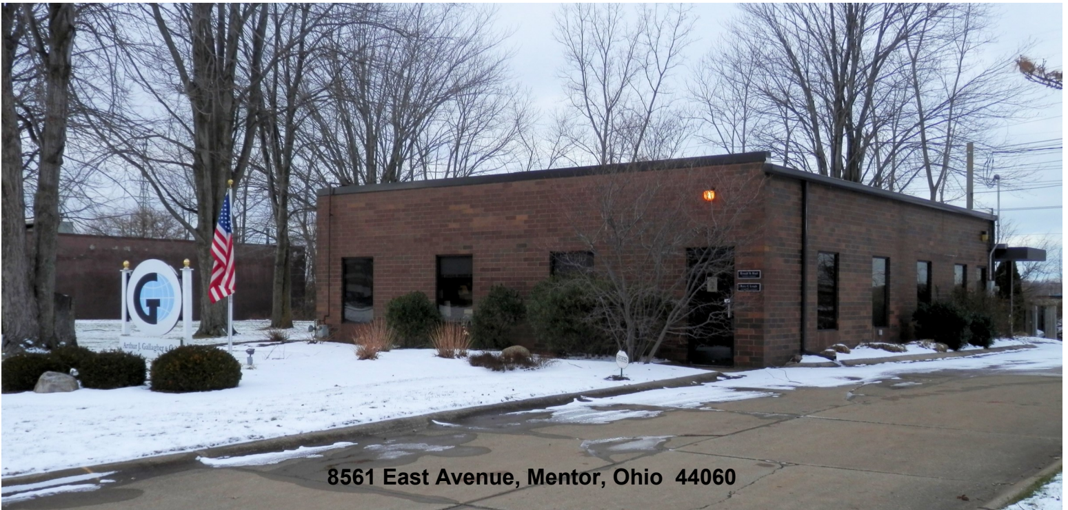
8561 East Avenue, Mentor, Ohio 44060