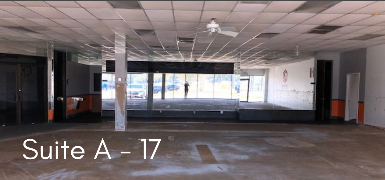
Suite A - 17