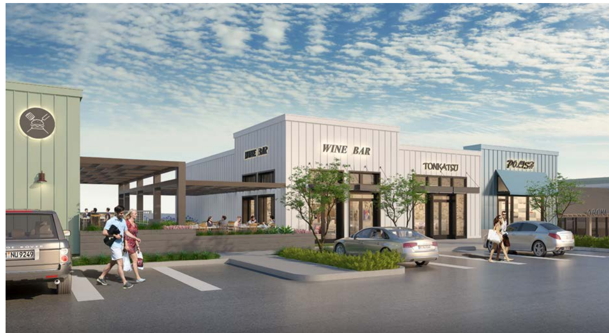
A COMPLETE CENTER REFRESH IS UNDERWAY.