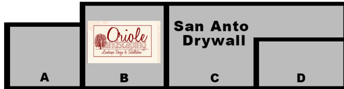
Building B - 11005 Midlothian Turnpike