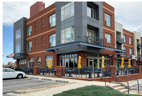
Southwest facing outdoor patio.