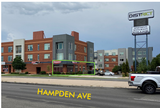
Available space fronts Hampden Ave with nearly 60,000 VPD.