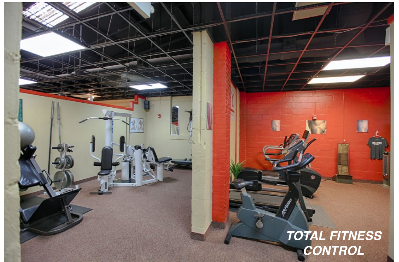
TOTAL FITNESS CONTROL