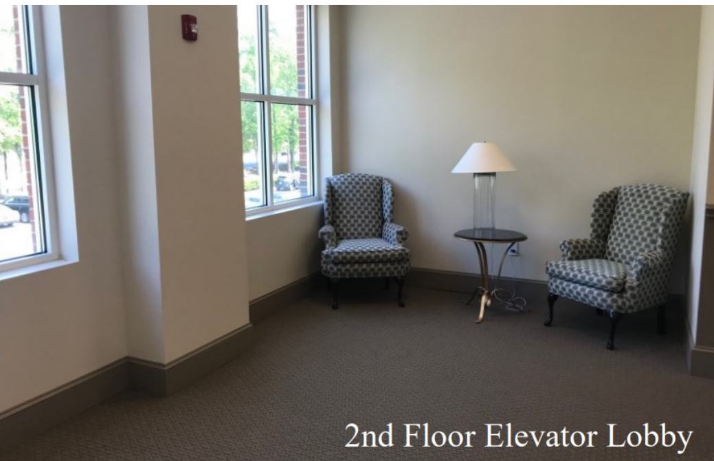
2nd Floor Elevator Lobby