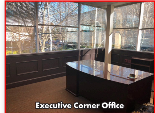
Executive Corner Office