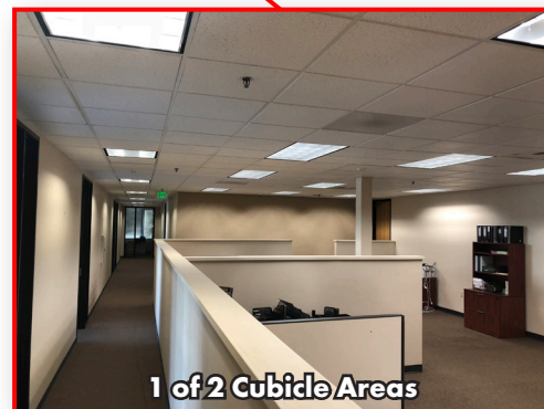
1 of 2 Cubicle Areas