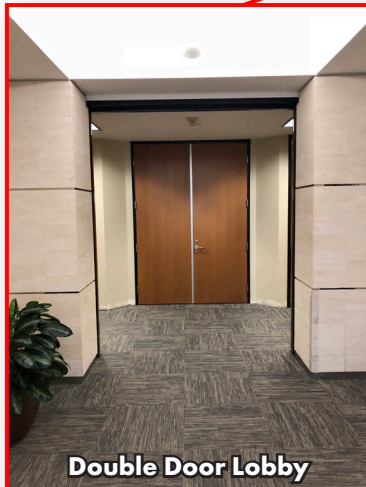
Double Door Lobby