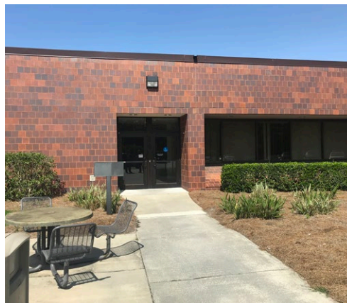
SPACE 2 ENTRANCE