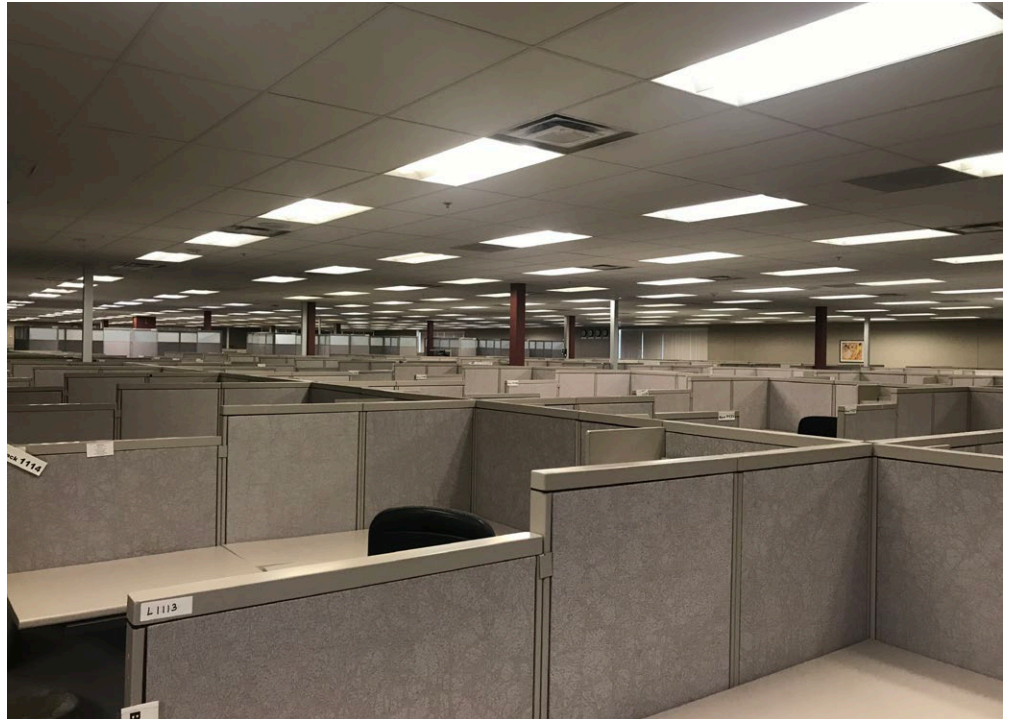
SPACE 1 OVERVIEW