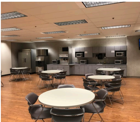
SPACE 3 BREAK ROOM