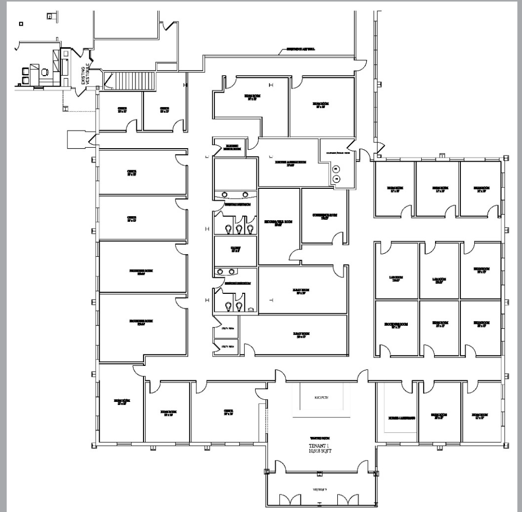
Conceptual Layout (divisible)