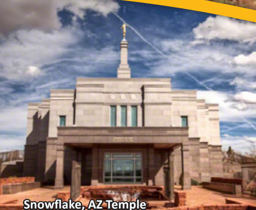
Snowflake, AZ Temple