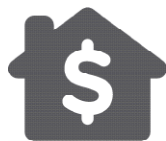
Average HH Income