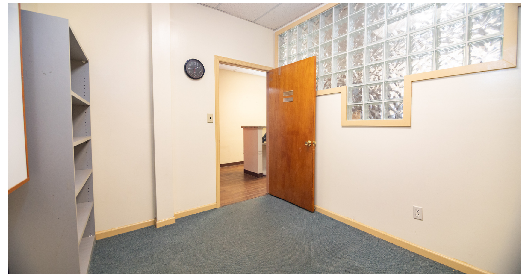
5 Private Offices