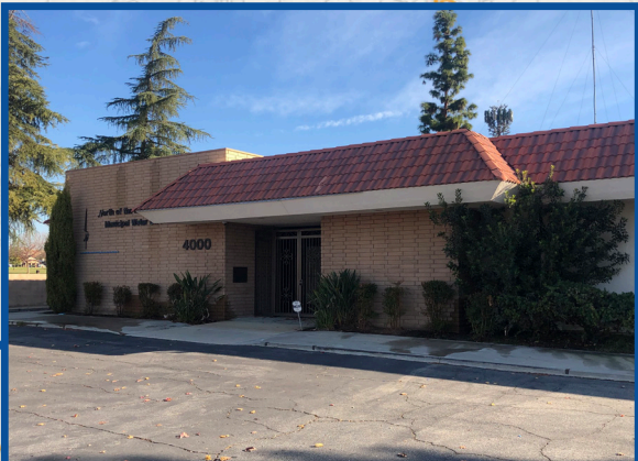
4000 Rio Del Norte Street

Matthew E. Starr, SIOR, CCIM ■ Principal ■ 661 616 3570 ■ matthew@asuassociates.com ■ CA RE #01367855 11601 Bolthouse Drive Suite 110 ■ Bakersfield, CA 93311 ■ 661 862 5454 main ■ 661 862 5444 fax