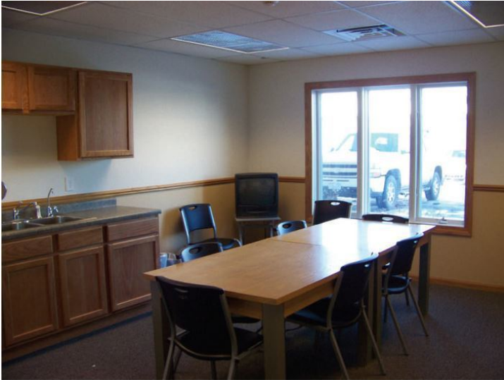
Common Break Room