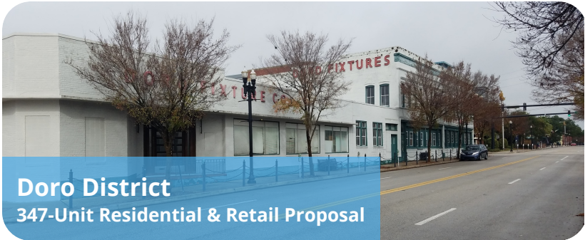
Doro District 347-Unit Residential & Retail Proposal