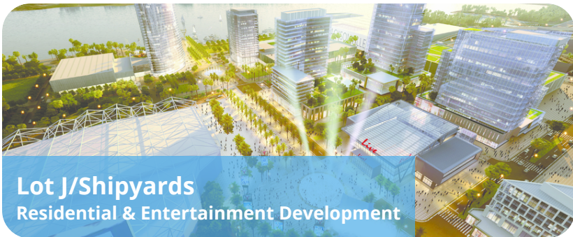
Lot J/Shipyards Residential & Entertainment Development