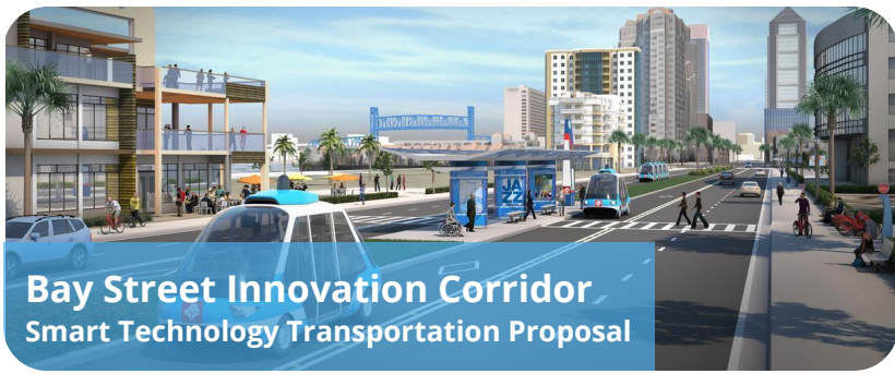
Bay Street Innovation Corridor Smart Technology Transportation Proposal