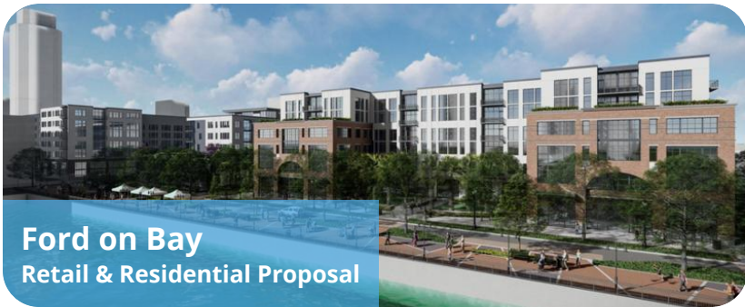
Ford on Bay Retail & Residential Proposal